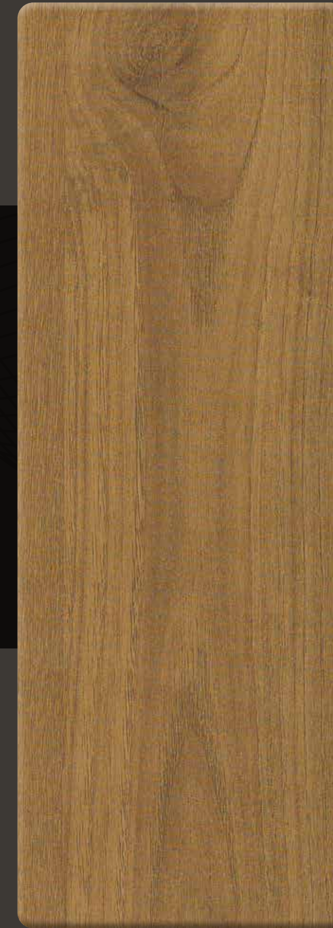
AM (WG) 3008 VALENCIA ASH SF/MF