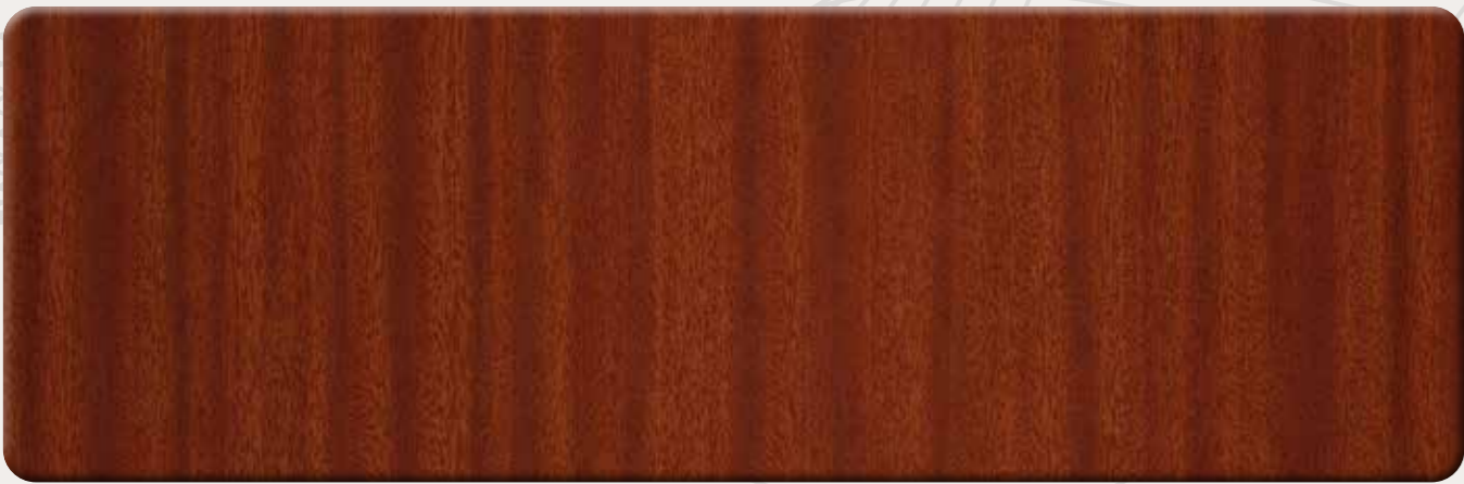
AM (WG) 4002 SAPELI SF/MF