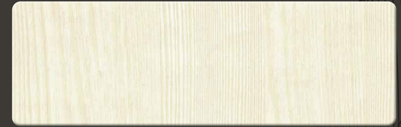
AM (WG) 4004 HIGHLAND PINE SF/MF