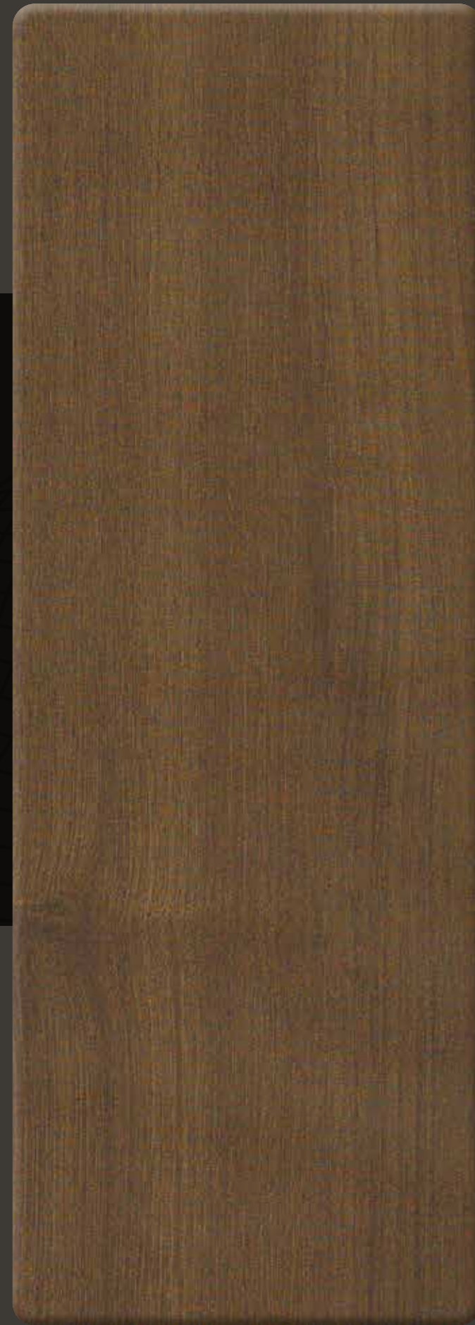
AM (WG) 3002 MOLDAU ACACIA DARK SF/MF