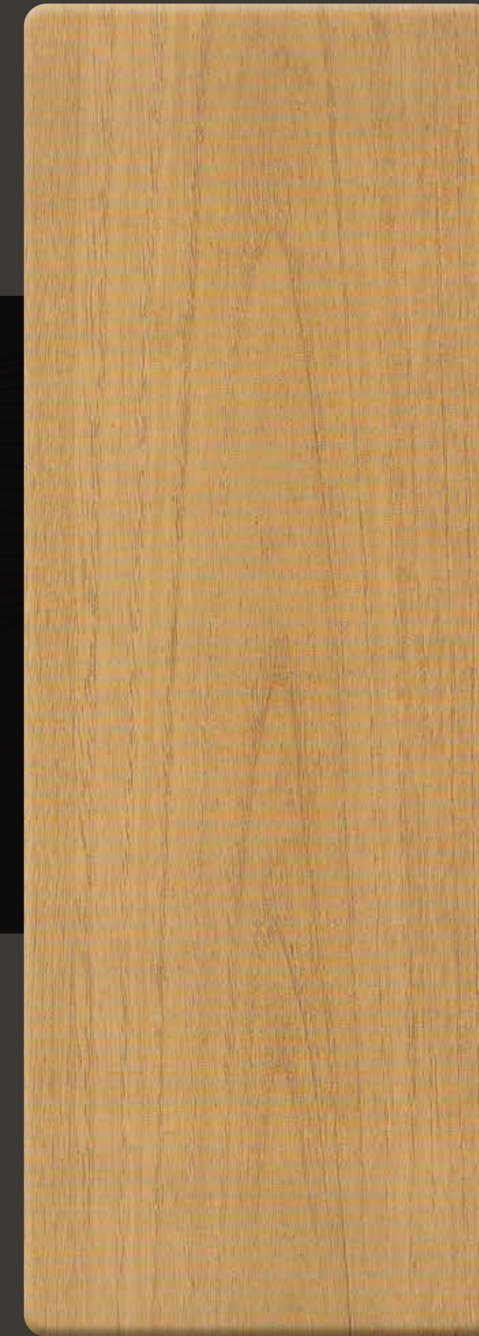
AM (WG) 3007 CHESTNUT SF/MF