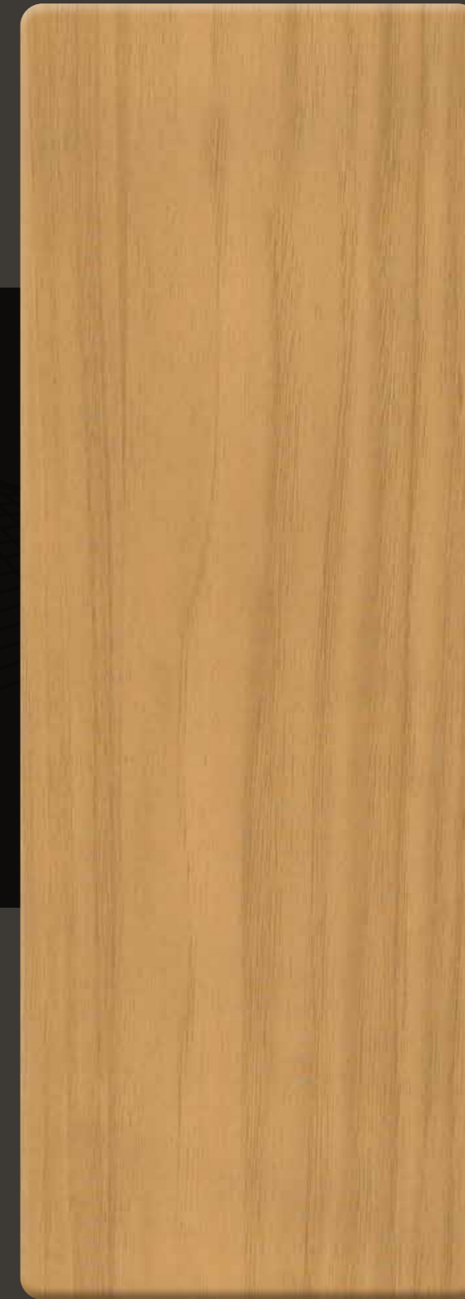
AM (WG) 3006 CROWN CUT SF/MF