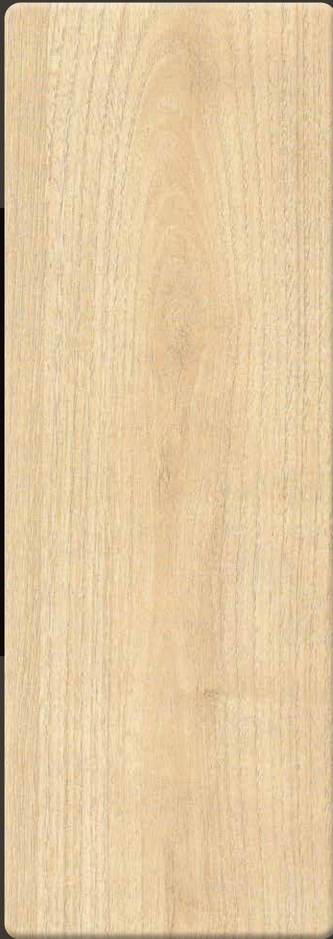
AM (WG) 3001 MOLDAU ACACIA LIGHT SF/MF