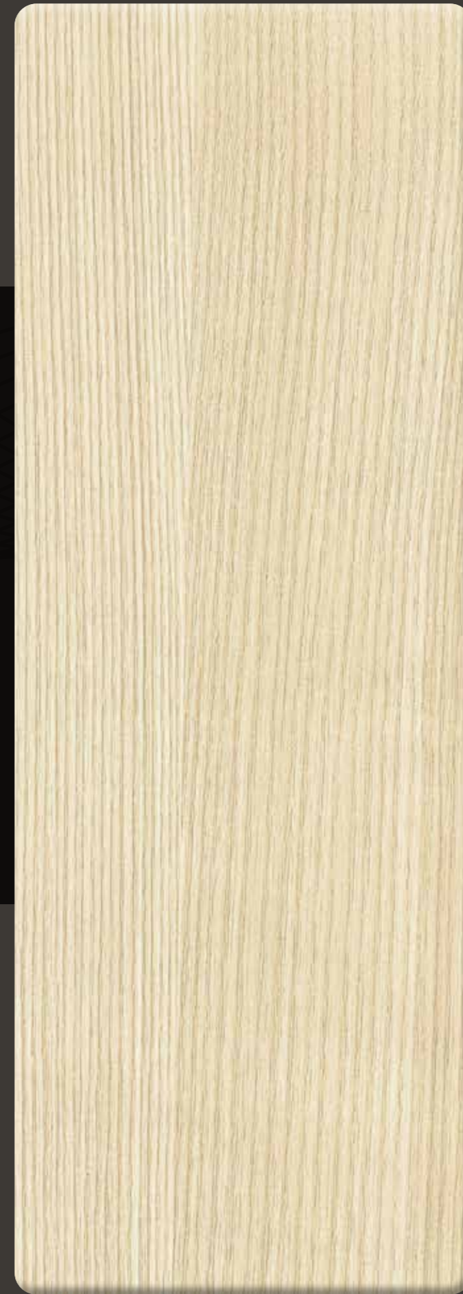
AM (WG) 3003 URBAN OAK LIGHT SF/MF