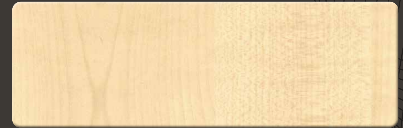
AM (WG) 4006 PRECIOUS BEECH SF/MF