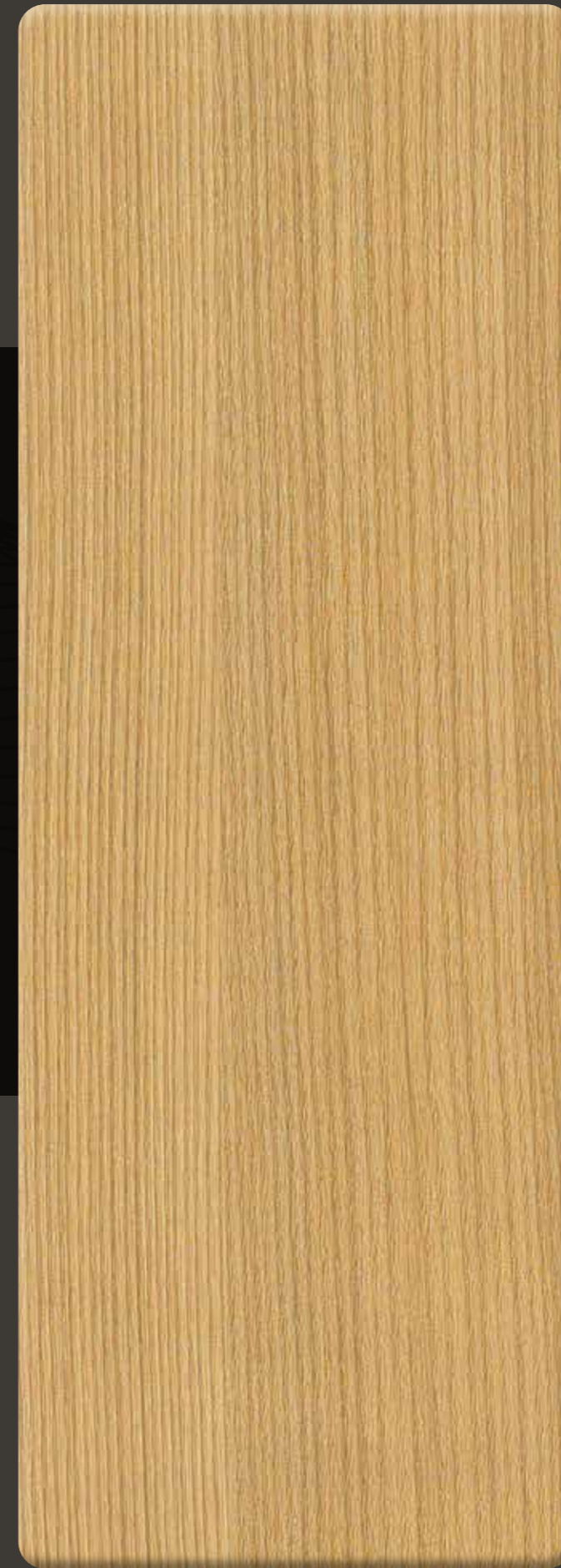
AM (WG) 3004 URBAN OAK SF/MF