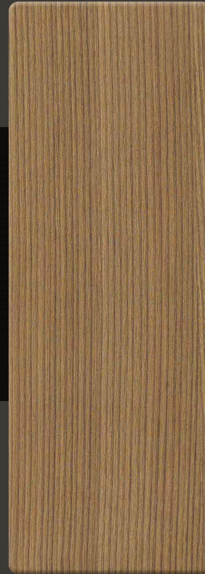
AM (WG) 3005 URBAN OAK BROWN SF/MF