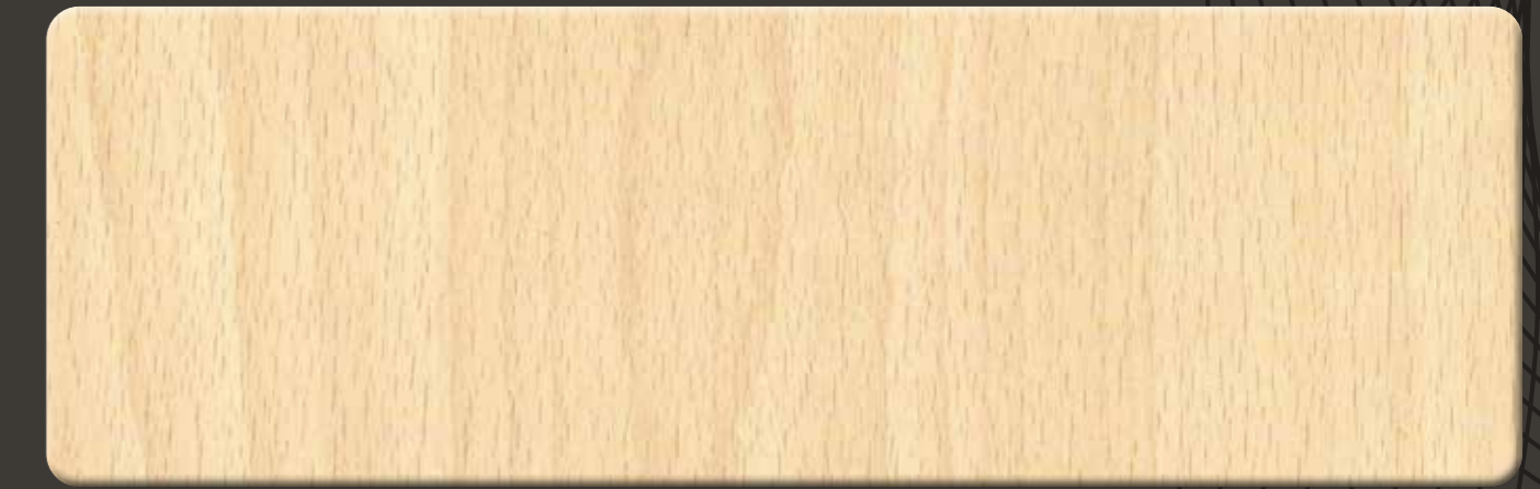
AM (WG) 4005 SUNSET BEECH SF/MF