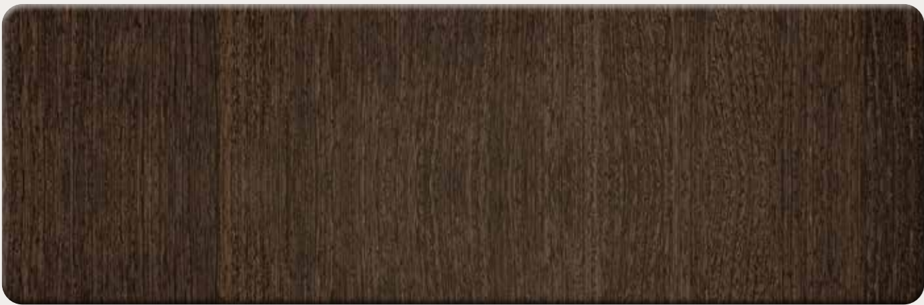
AM (WG) 4003 DARK WENGE SF/MF